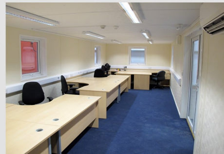
Office with carpet tiles