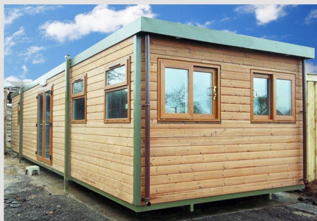
Thermowood timber external cladding